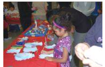
Dinning and creating ornaments at our Tree Trim