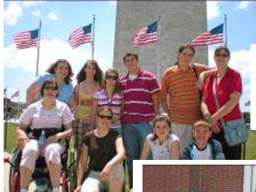
Senior Highs in Washington