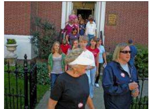
Starting out on the CROP Walk