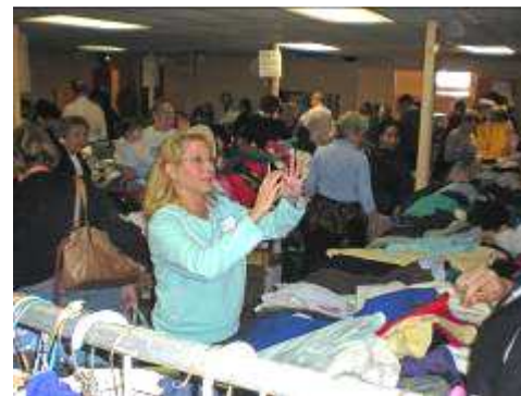
Bargaining at the Rummage Sale